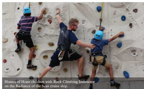
Homes of Hope children with Rock Climbing Instructor on the Radiance of the Seas cruise ship.