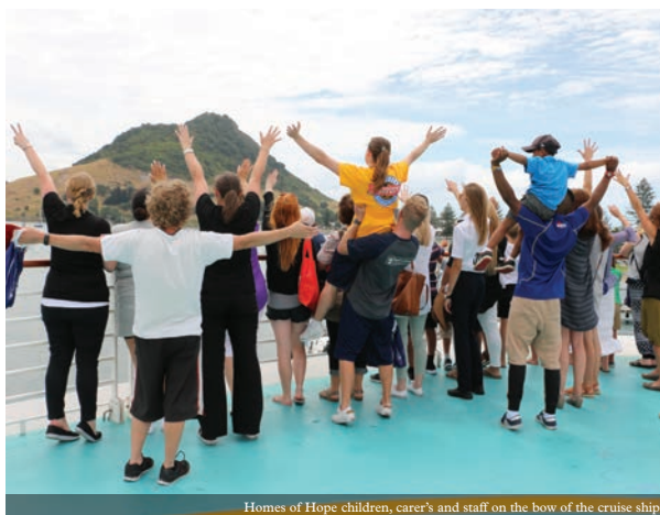
Homes of Hope children, carer's and staff on the bow of the cruise ship.

Titans Gold Sponsors: Bay Physiotherapy, Gartshore Group, Guy Refrigeration & Air-conditioning Ltd, McLeod Cranes, Pak'n Save, Rowesdale, YOU Travel