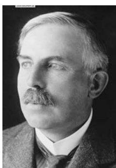
2 ND RUTHERFORD House