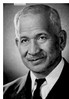
3 RD Ngata House