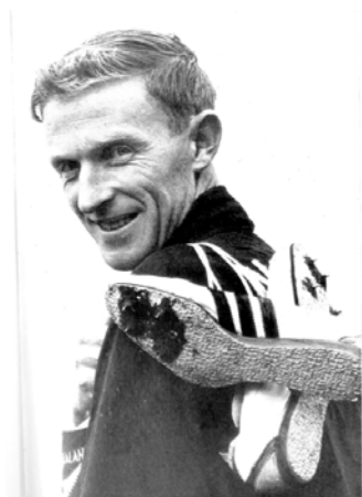
1 ST HALBERG House

A big thank you for your support in making the College's Work Day held on 12th May such a big success. The boys raised over $40,000 that will go towards the purchase of IT equipment, some outdoor basketball hoops and lunchtime sports gear. As part of the Work Day, the Form Classes compete in a House Competition for House points. This year the winning Houses are: