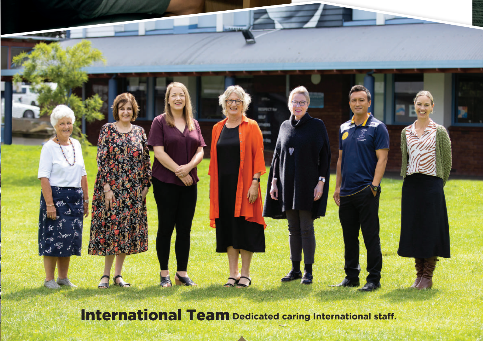
International Team Dedicated caring International staff.

ERO said in their latest report: High levels of Pastoral Care and student success are a priority of the school.