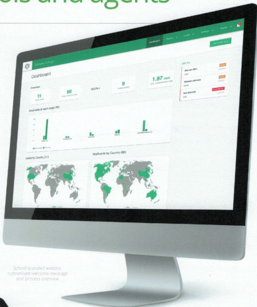
School branded website, customised welcome message and process overview