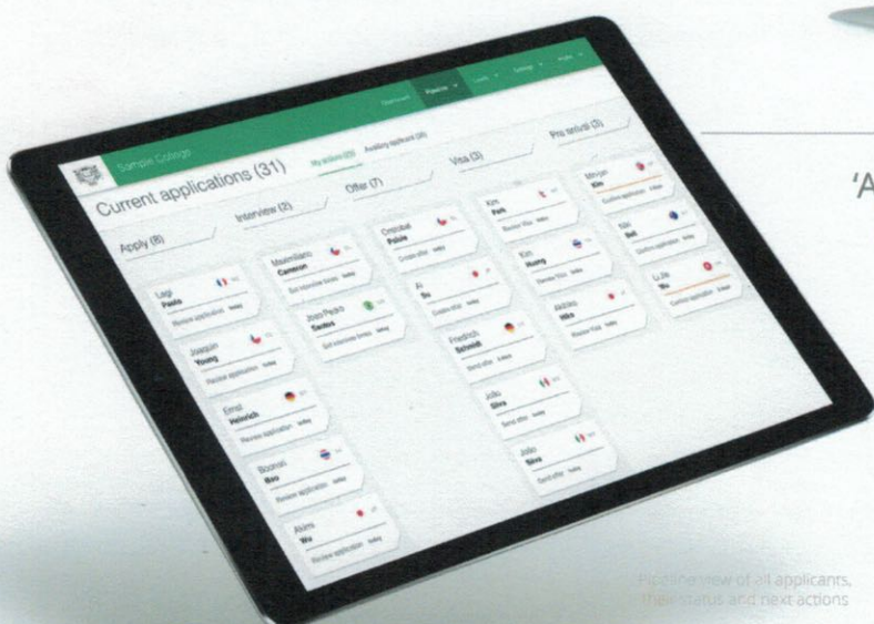
Pipeline view of all applicants, their status and next actions